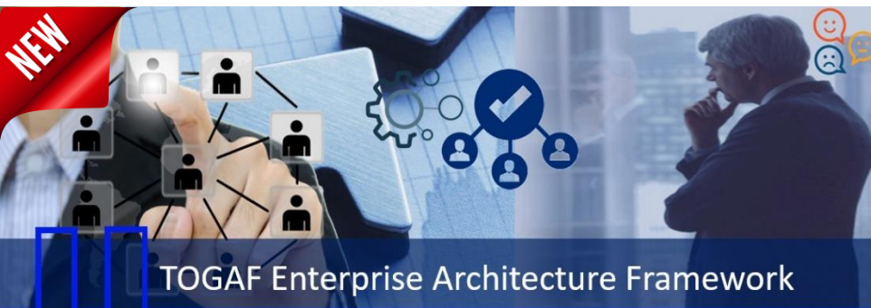
TOGAF Enterprise Architecture Framework