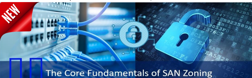
The Core Fundamentals of SAN Zoning

These two workshops are scheduled in November 2020 as a part of our online WFH program.